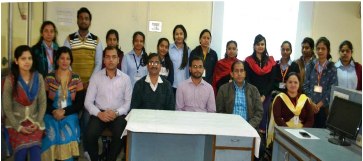
Placement drive by “Sapalogy Pvt Ltd, Narendra Nagar, Nagpur”