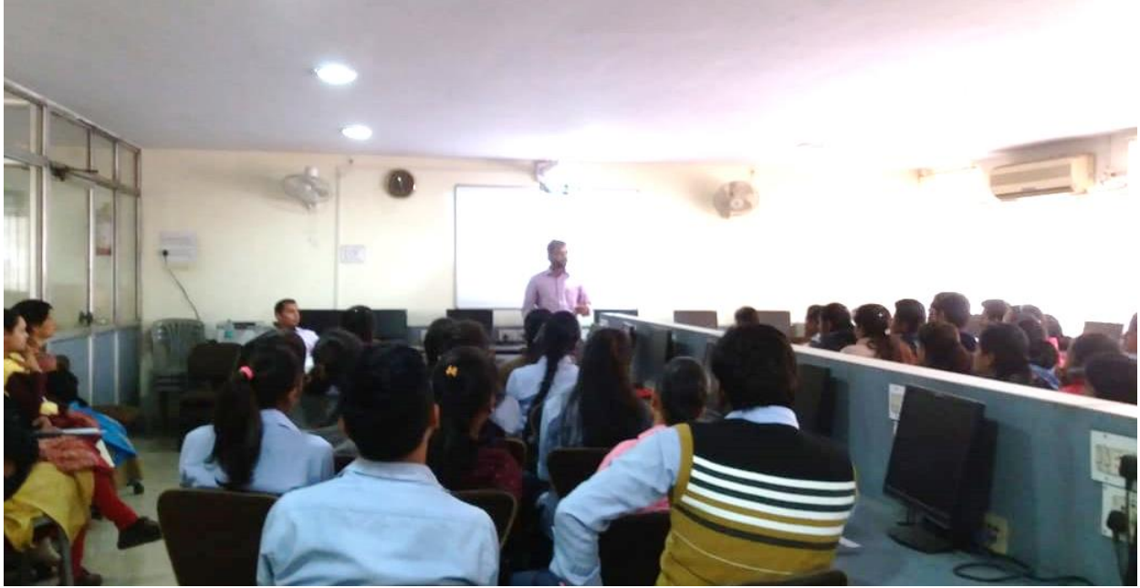
Glimpse of Placement drive by “Sapalogy Pvt Ltd, Narendra Nagar, Nagpur”